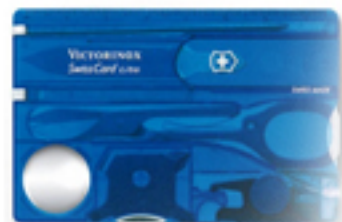
SwissCard Lite 0.7322.T2