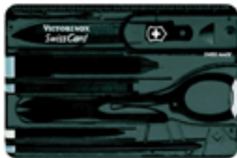
SwissCard Onyx 0.7133.T3