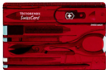
SwissCard Ruby 0.7100 .T