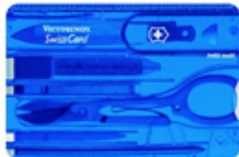
SwissCard Sapphire 0.7122.T2