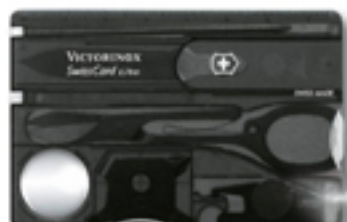
SwissCard Lite 0.7333.T3