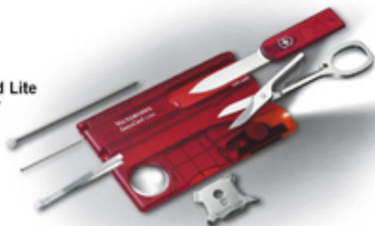
SwissCard Lite 0.7300.T